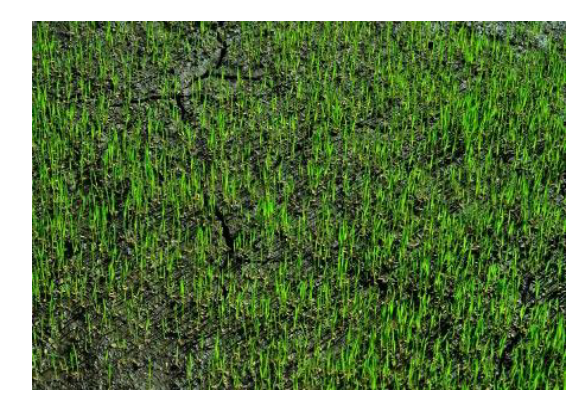
Dense fields have high plant count